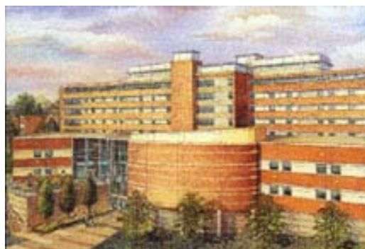
An artist's rendition of the renovated JRP Hall.

In the fall of 2000, the McNair Scholars Program at the University of Kansas will relocate to the newly renovated Joseph R. Pearson (JRP) Hall.